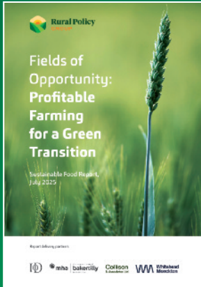
Fields of Opportunity: Profitable Farming for a Green Transition Published 2025