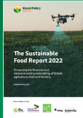
Enhancing the Financial and Environmental Sustainability of British Agriculture, Food and Farming Published 2023